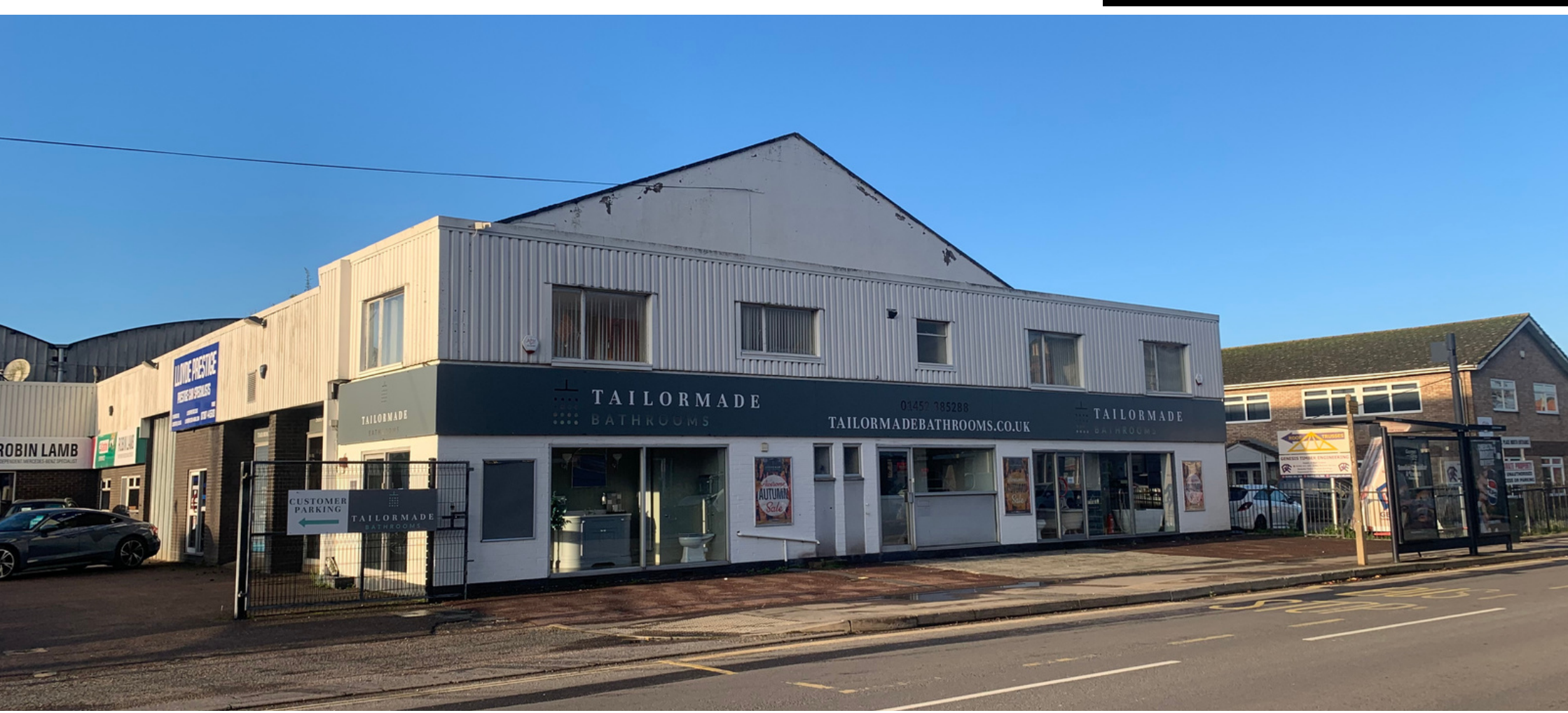
130, Bristol Road, Gloucester, GL1 5SQ

Prominent Roadside Position | Exclusive Entrance | Allocated Parking