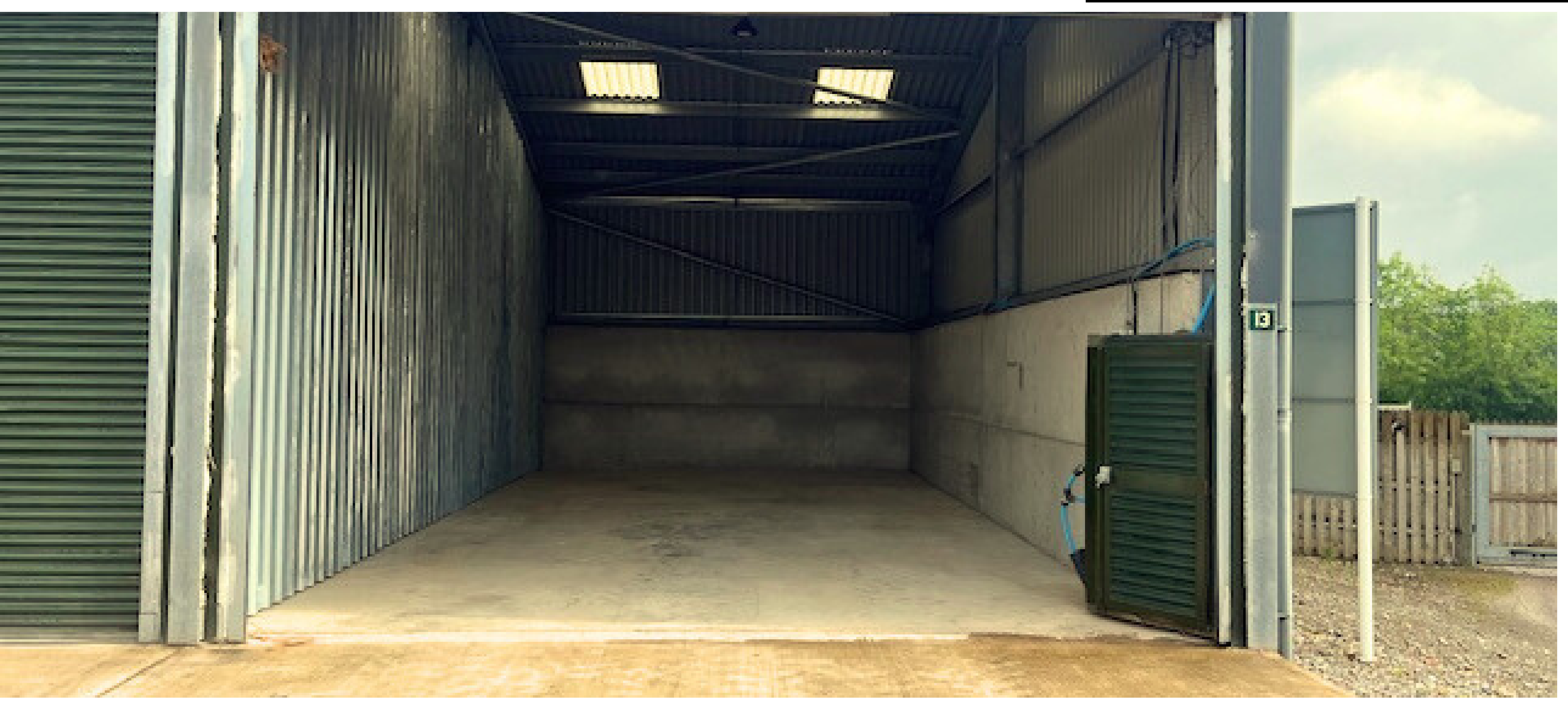
Unit 13,Gorsley Business Park, Cothars Pitch, Gorsley, Ross-on-Wye, Herefordshire, HR9 7SE Excellent location directly adjacent J3 M50 Motorway