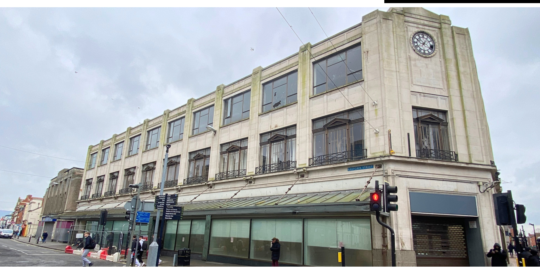
44-50 Eastgate Street, Gloucester GL1 1QN Accommodation Across 5 floors | Retail Area | May Suit a Variety of uses (STP)